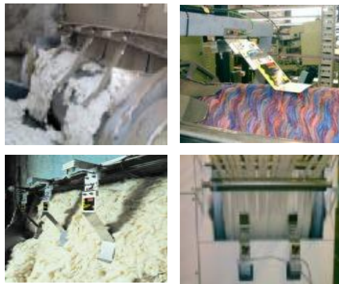
Typical DRYCOM On-Line Dryer Moisture Control Applications