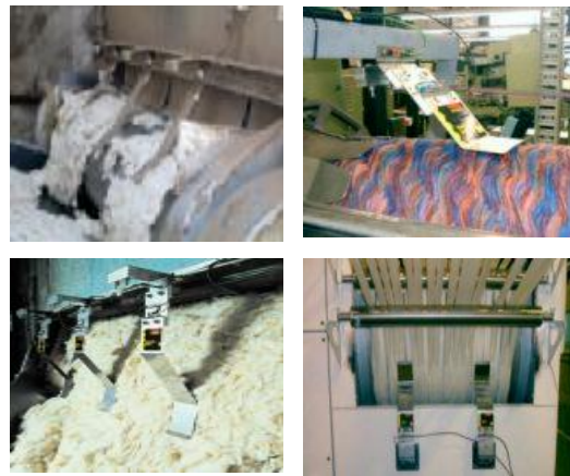
Typical DRYCOM On-Line Dryer Moisture Control Applications