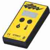
AQUAFLEX Handheld Reader