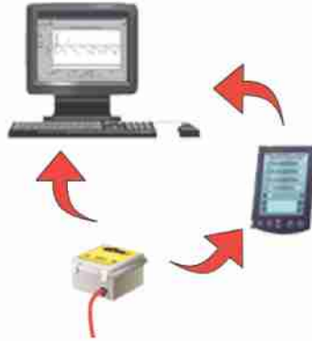
AQUAFLEX Logging Sensor