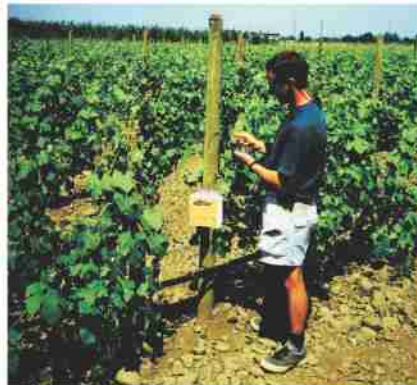
AQUAFLEX installation in a USA vineyard. 'AQUAFLEX is a vital tool for effective irrigation management.'

The most accurate and repeatable analysis of soil moisture of any system available.